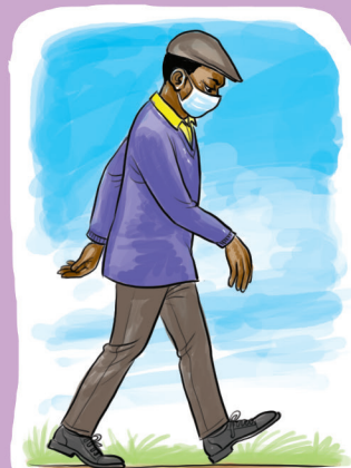
Go for a walk