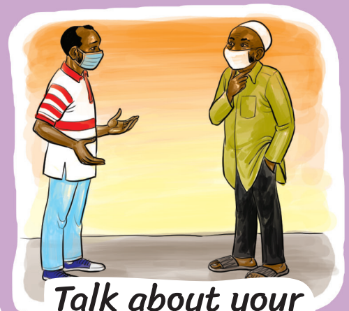
Talk about your feelings

Violence is never okay. Find other ways to manage your emotions.