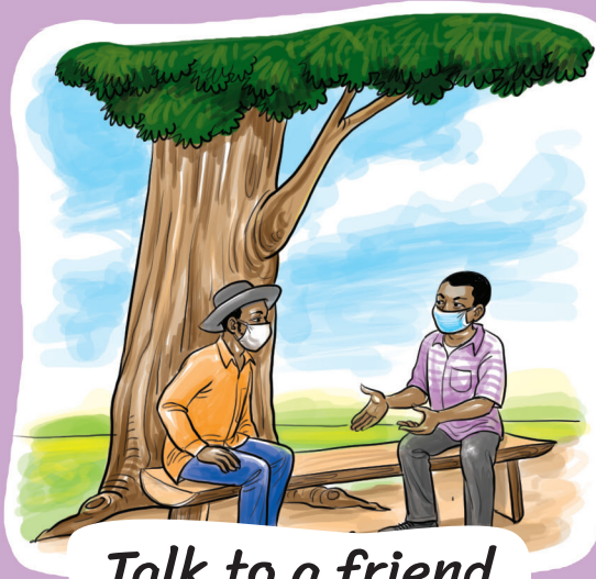
Talk to a friend